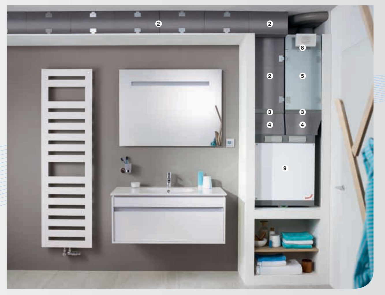
Installation solution for the bathroom - open

Easy installation: the compact ventilation system is quick and easy to install, both in new buildings and in renovation projects. Easy access to all components for servicing and maintenance.