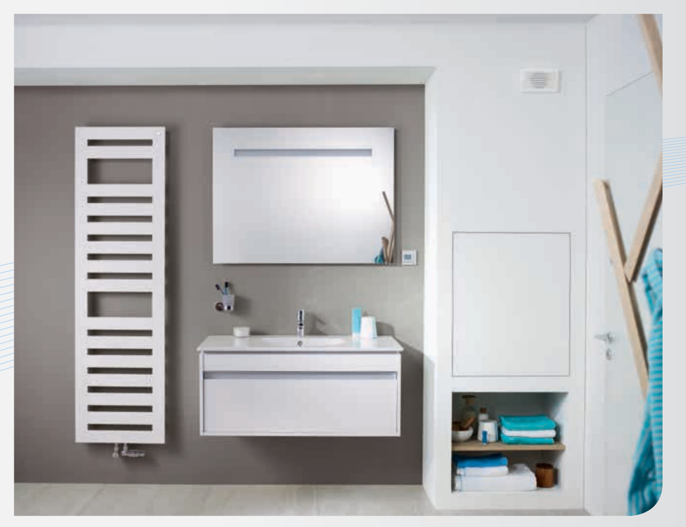
Installation solution for the bathroom - closed

Appearance: it is good when the apartment design has no restrictions: The elements of the ventilation system are concealed , leaving only the control unit and the supply and extract air valves visible.