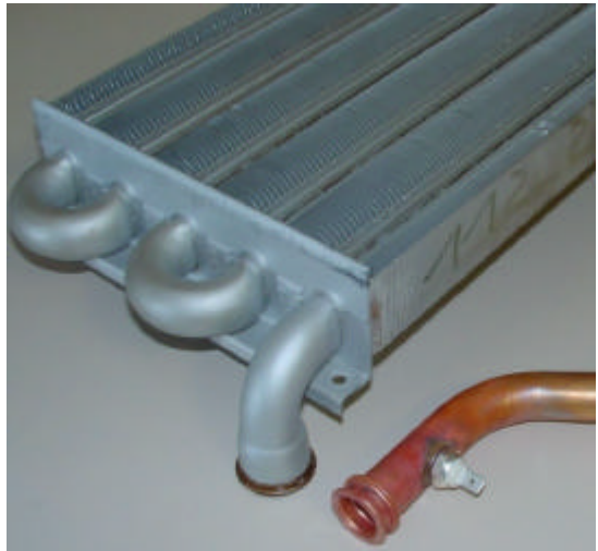
Fig.2: new primary heat exchanger (closed fin)

Thus, the following modifications occurred: