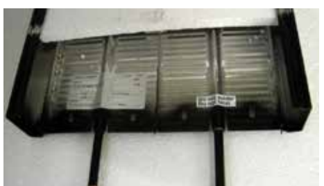
Fig.1: Label location exterior (On insulation, above water connection) Fig.2: Label location interior (Under insulation, above water connection)