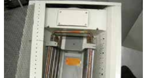
Fig.1: Label location exterior (Water connection end)