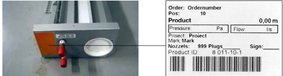
Fig.1: Label location exterior (Air connection end)