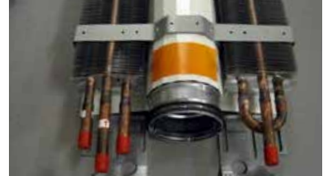
Fig.1: Label location exterior (On plastic wrapping)