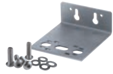
-K DP- wall bracket CODE RB7400021