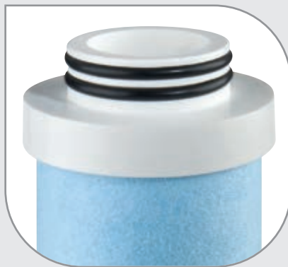
BX Quick-fit configuration with 45 mm double o-ring collar. Fit to Plus 3P BX housings, DP housings, K DP housings, Depural® Top, Bravo DP, Oasis DP.