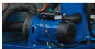
Pump P3 (3 barg) / P5 pump (5 barg, optional).