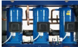
Optimised performance thanks to multiscroll logic.