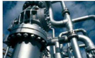
Ideal for medium and large process cooling applications.