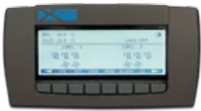
Semigraphic user interface with multifunctional buttons and dynamic display icons.