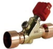
The electronic expansion valve allows an improvement of performance.