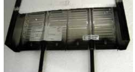
Fig.1: Label location exterior (On insulation, above water connection)