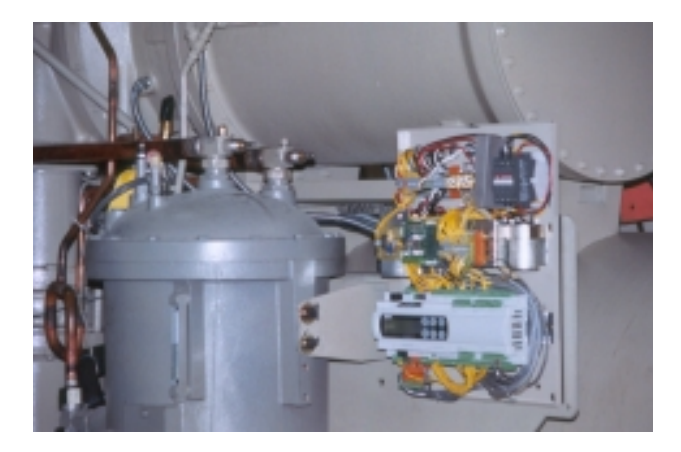
Figure 2, Compressor Controller

unprecedented reliability in a chiller control system. This panel also contains the oil pump contactor and overload.