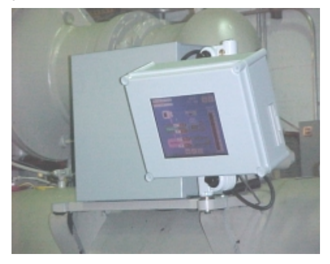
Figure 1, Unit Controller and Operator Interface Touch Screen

The Unit Controller and Operator Interface Touch Screen mounted on a chiller unit are shown to the left. Note that the touch screen panel is on an adjustable arm so that it can be positioned comfortably for the operator. Also note that the right side of the panel contains a built-in floppy drive from which data can be conveniently download. These are but a few of the thoughtful touches built into this control system to optimize ease of operation, reliability, and efficient operation.