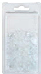
POLYPHOSPHATE CRYSTALS 6/10 (small) 160 g blister, refill TO DOSAL.