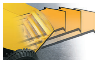
Flow lamellae and the high-pressure radial fan enable increased dry air distribution in the room parallel to the floor.

A fully automatic condensed water pump is optionally available for permanent operation of the TTK 800.